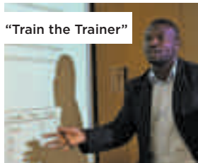
"Train the Trainer"

Wentworth has seen a great number of intuitive innovations from faculty, students, and alumni alike.