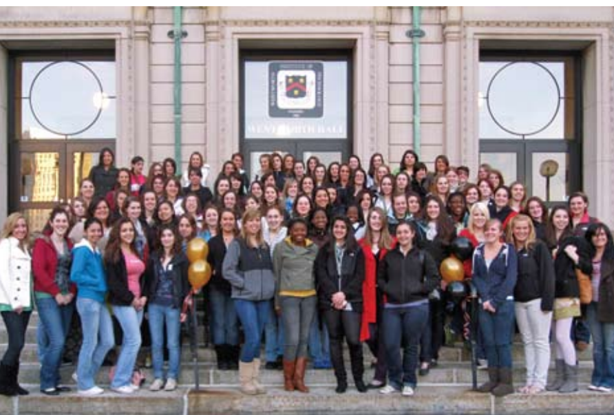
Prospective students attend the Women's Overnight

To advance Wentworth's reputation for supporting diversity, efforts have been focused on expanding recruitment both nationally and internationally. Admissions counselors' recruitment