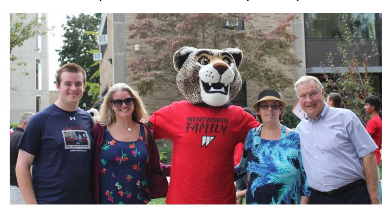
October 13-15: Family Weekend - Save the Date for this year's Family Weekend.